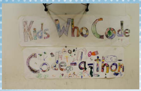
Student-created banner for Kids Who Code Code-a-thon