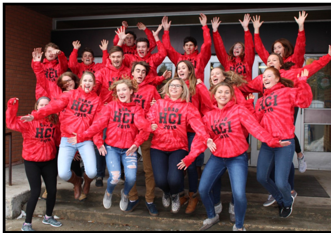
GRADS CELEBRATE THE ARRIVAL OF THEIR GRAD HOODIES