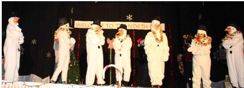
Middle Years North Pole Exposure