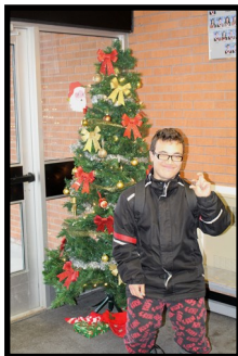
The lobby looks festive after members of the Student Council decorated.