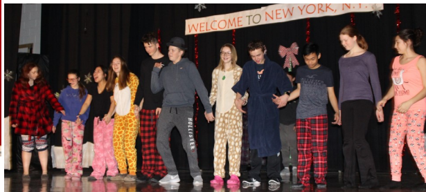
Gr. 9—Home Alone 2