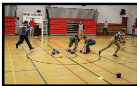
Four Corner Dodgeball

Following the game, students will be returning to HCI for a movie and snacks.