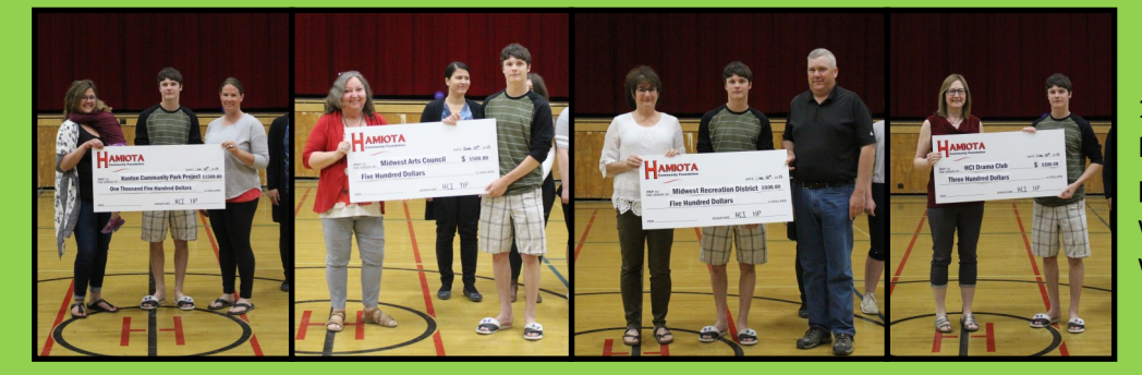
On Monday, June 10th the Youth in Philanthropy group presented the four winning applicants with cheques.

The HCI drama requested up to $450 to go towards new microphones and technical gear for their performances. They raise money by selling baking at intermissions and selling tickets for the show. We granted them $300 to help keep the performances alive!